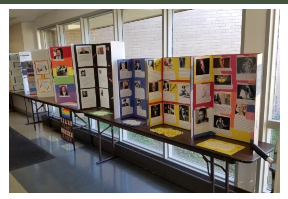
DART Educational Displays

Through discussion with the Internship Training Director, interns are able to decide the extent to which they want to be involved in the DART committee (i.e. developing new initiatives, collecting data, or simply regularly attending meetings). If there is a diversity project that is of greater interest, with approval from the ITC, interns may forgo attending the DART meetings in order to focus on this project and ultimately provide a presentation of their work at the end of the internship year.