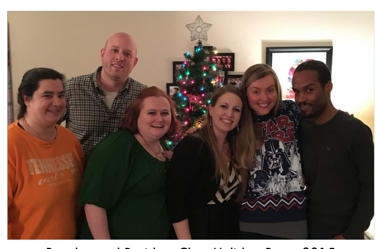
Postdoctoral Resident Class Holiday Party 2015

The Chicago School of Professional Psychology (2022) New Outlook Program